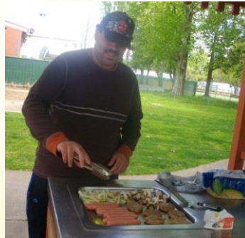
Cooking a BBQ

Recreational, social and prevocational activities, developing life skills, and community involvement are some of the experiences chosen by clients.