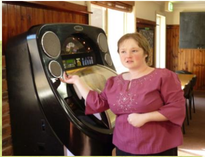
Lunch at the club

LFE services support clients to access a range of purposeful activities that reflect their choices, needs, goals and life stage.